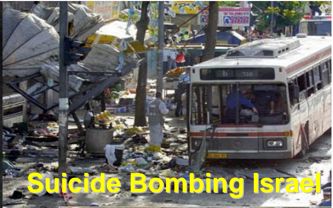
Suicide Bombing Israel