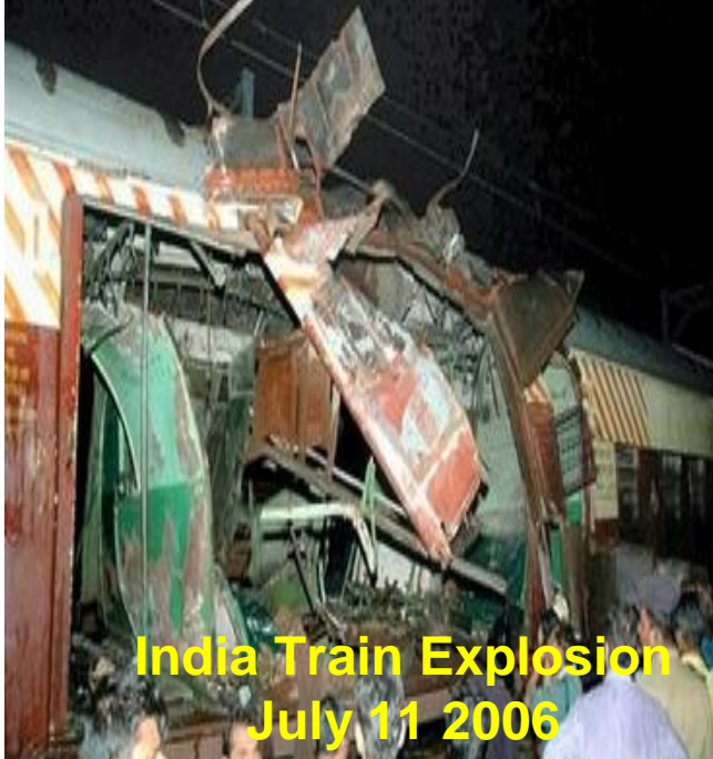
India Train Explosion July 11 2006