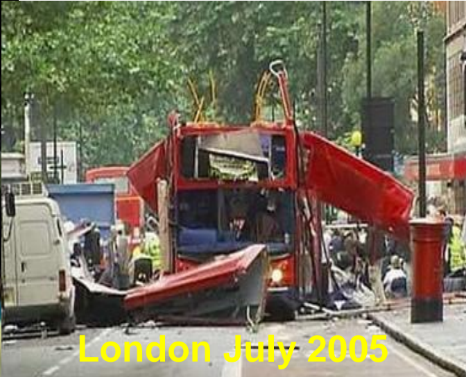
London July 2005