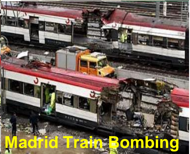
Madrid Train Bombing