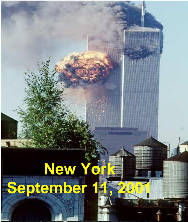
New York September 11, 2001