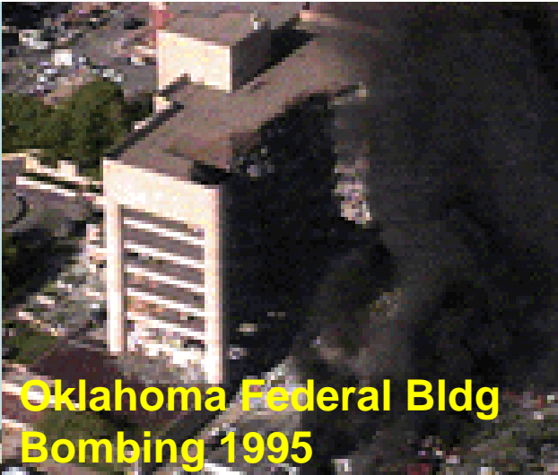
Oklahoma Federal Bldg Bombing 1995