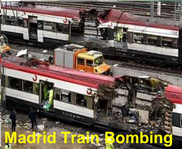
Madrid Train Bombing