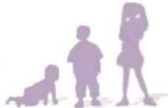
7-12mo 1-3 yr 4-8 yr