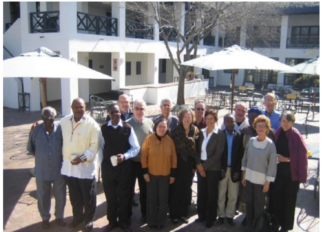
Review Panel Meeting-Johannesburg (7/08)

“Health systems need to be improved so that more health is achieved for the money”.