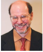
H. Robert Horvitz, Ph.D. Investigator, Howard Hughes Medical Institute; and Professor of Biology Massachusetts Institute of Technology