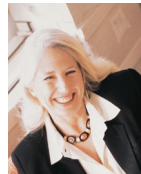
Nancy S. Wexler, Ph.D. Higgins Professor of Neuropsychology Departments of Neurology and Psychiatry Columbia University